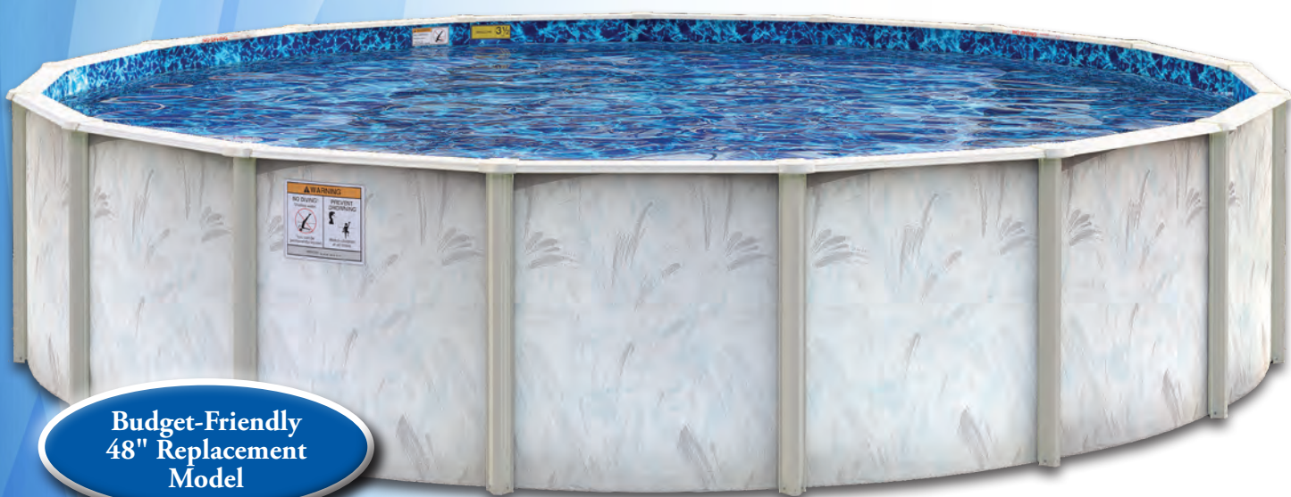
Budget-Friendly 48" Replacement Model