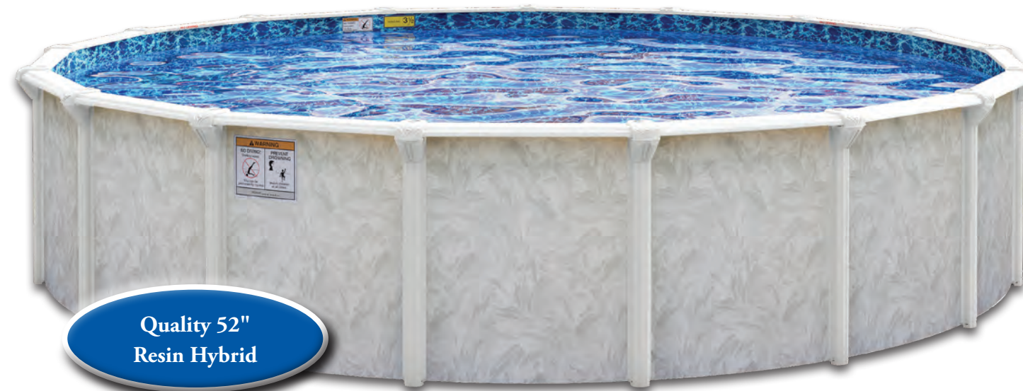
Quality 52" Resin Hybrid