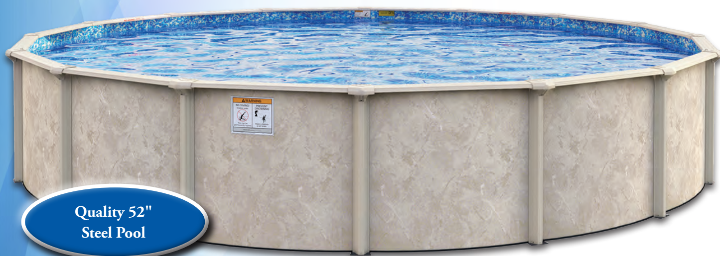
Quality 52" Steel Pool