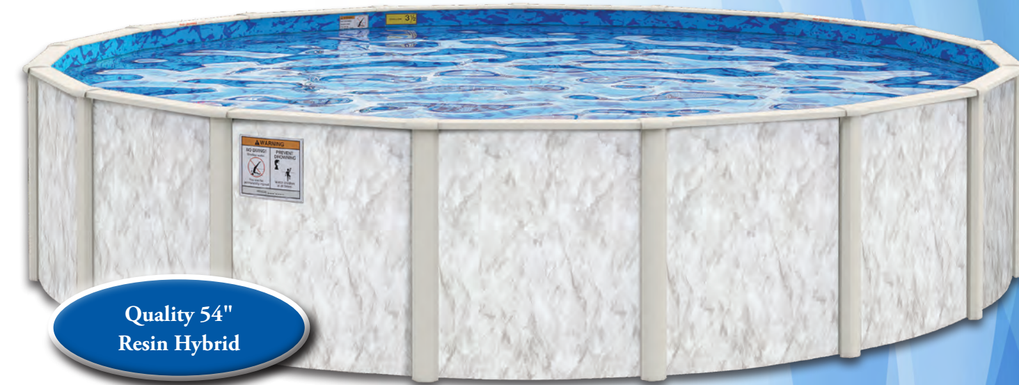
Quality 54" Resin Hybrid