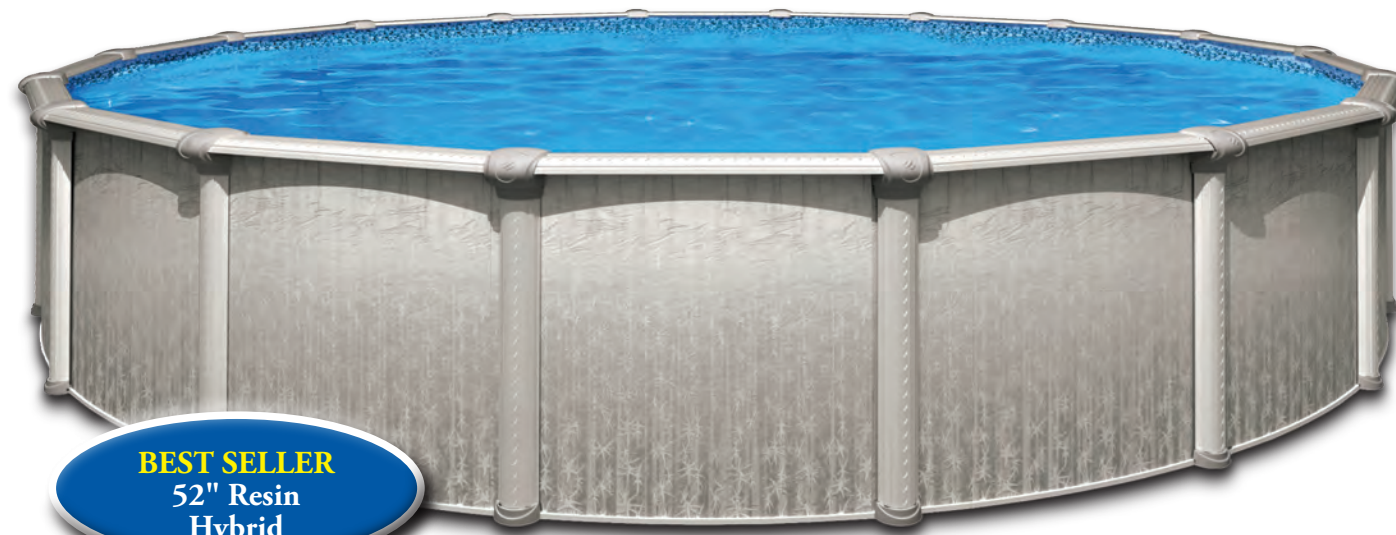
BEST SELLER 52" Resin Hybrid