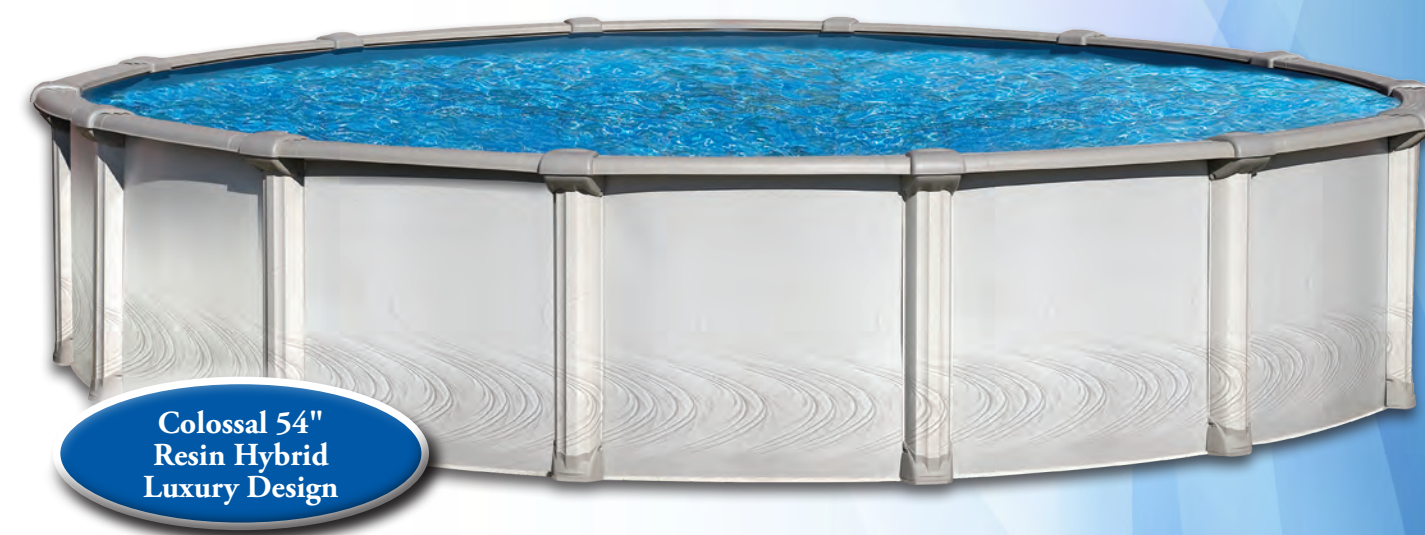
Colossal 54" Resin Hybrid Luxury Design